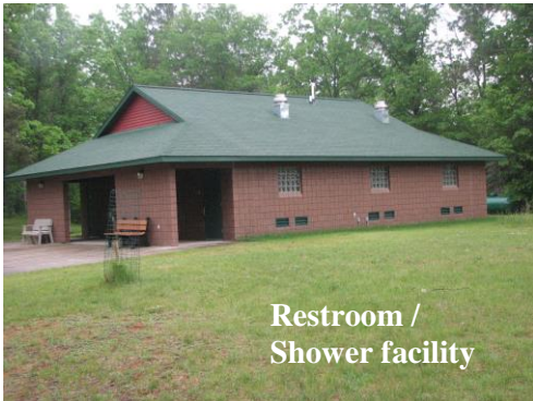
Restroom / Shower facility