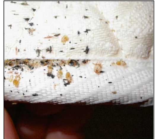
Bed bugs and fecal blood stains on a mattress.